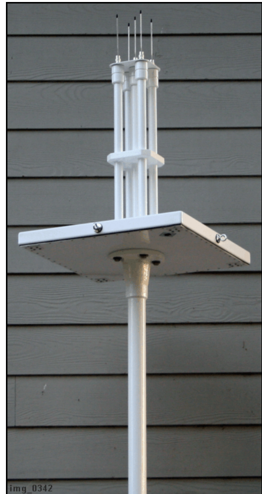
DFA-1405B1 Mounted on 5' Iso-Mast

In fact, these problems actually occur as a result of a design deficiency that is overcome in RDF Products mast-mounted DF antennas. All such DF antennas manufactured by RDF Products have been specifically designed so that the aerials are properly decoupled from the supporting mast, thus eliminating the above-mentioned mast-induced performance degradations. DF antenna performance is thus unaffected by the mast and there are no frequency "holes".